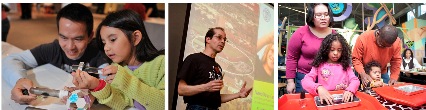
From left: NanoDays activities at the Museum of Science, Boston; Sciencenter in Ithaca, NY; and Port Discovery Children's Museum in Baltimore, MD.

Local communities experience many of these activities first hand at museum and research institutions. Visitors can experience the power of science fiction storytelling—imagining their own future full of new nanotechnologies. Hands-on activities invite visitors to explore polarized light, investigate how scientists use special tools to study tiny things, and envision how nanotechnology could change how we eat! Other activities include experimenting with heat transfer and completing an electrical circuit using just a pencil and paper.