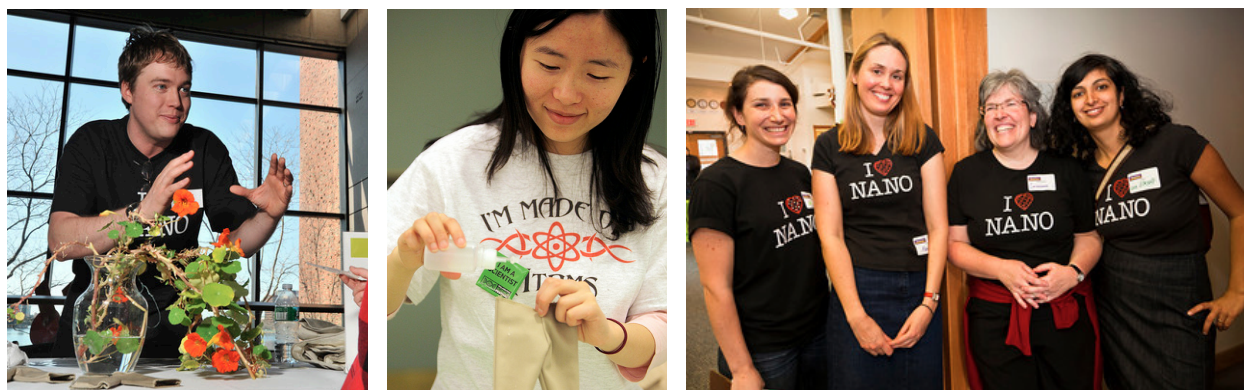
NanoDays staff and volunteers at the Museum of Science, Boston, Franklin Institute in Philadelphia, PA, and Sciencenter in Ithaca, NY.