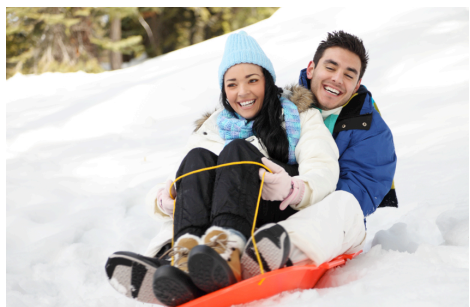
STFs make a winter hat more like a helmet

The way a material behaves on the macroscale is affected by its structure on the nanoscale. Changes to a material's molecular structure are too small to see directly, but we can sometimes observe corresponding changes in a material's properties.