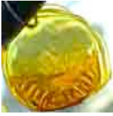
silver nanoparticle stained “glass”