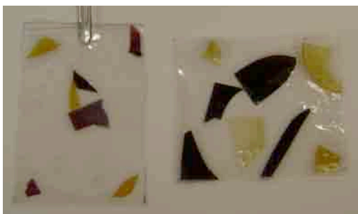
Examples of sun catchers made with nanoparticles stained glass disks.

After the program presentation, add making a sun catcher as a possible hands-on activity. Demonstrate how to make the sun catcher (using the steps in “Preparing a sample sun catcher”). Have visitors fold the contact paper strip in half, and peel off the backing to the fold. Demonstrate that the nanostained glass pieces can be cut into different sizes and arranged on the stick side of the contact paper. Allow time for visitors create their patterns. Once completed, instruct visitors to continue to peel off the paper backing. Once the paper backing has been removed, demonstrate folding the contact paper over onto itself, to create the sun catcher. Instruct visitors to punch a hole near the top of one edge and thread a piece of yarn or string through the hole. A tag can be added to the string to reinforce that “Gold nanoparticles are red” and “Silver nanoparticles are yellow”.