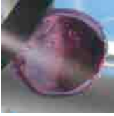
gold nanoparticles stained “glass” (color can vary from red to purple)