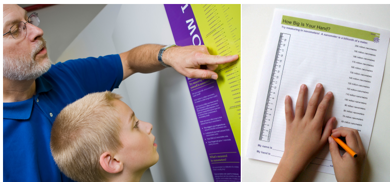
Measure yourself in nanometers!