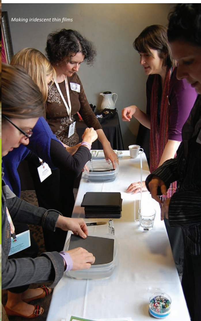
Making iridescent thin films

The NISE Network is funded through awards from the National Science Foundation (DRL 0532536 and 0940143). Launched in 2005 by the Museum of Science, the Science Museum of Minnesota, and the Exploratorium, the Network is now led by 14 museums, universities, and other institutions across the nation.