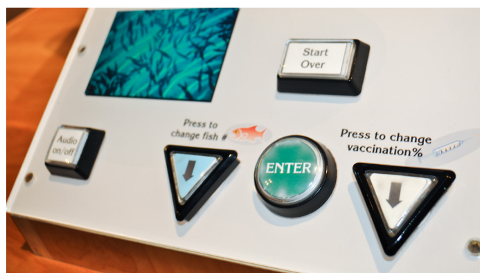
Universally designed computer interface

The universally designed computer interface consists of five large push-buttons, each with a distinctive shape. At the left, a single rectangular button toggles audio narration on and off. At the bottom center, a large square button selects content (the “enter” function). Arrow keys on each side of the enter button sort through choices on the screen. A rectangular button on the top restarts the media program at the beginning. These controls are accessible for persons with limited dexterity and mobility (who can simply use a closed fist to operate them), as well as persons who are blind for whom existing interfaces (such as touchscreens and trackballs) are largely inaccessible.