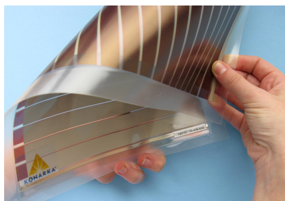
Thin film solar panel

The way a material behaves on the macroscale is affected by its structure on the nanoscale. Thin films can reflect light in special ways, because they're only a few hundred nanometers thick—in the same size range as the wavelength of visible light.