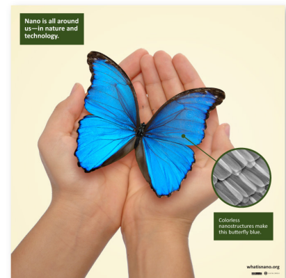
Blue Morpho Butterfly