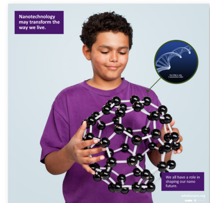
Boy and buckyball