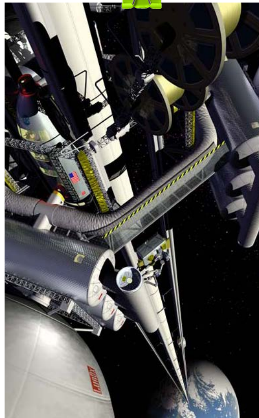
Artist illustration of a space elevator.

If these scientists are successful, someday it might be easy to bring people and materials into space. We all need to think about the kind of world we want in the future, and begin planning for it. Do you think exploring and developing space is important? If so, what kind of society should we create there? Or do you think we should spend our time and money on something else, instead of a space elevator?