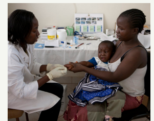
Three out of 4 malaria deaths occur in children under five

Young children are particularly susceptible. In 2015, malaria killed an estimated 306,000 children under age five.