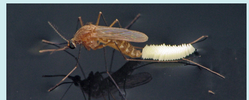
Mosquitoes lay eggs on water