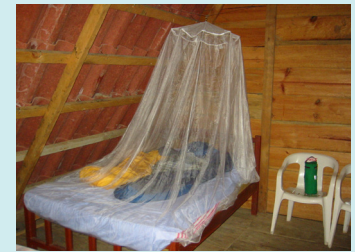
Traditionally, bed nets are used to protect against mosquito bites