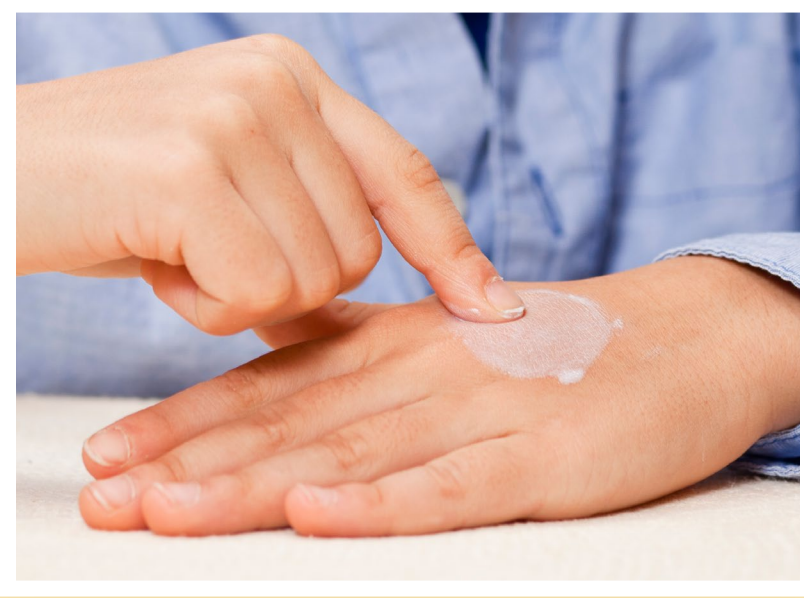
Gary Hodges / NISE Network