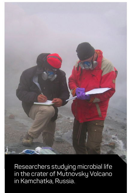
Researchers studying microbial life in the crater of Mutnovsky Volcano in Kamchatka, Russia.

NASA missions are exploring the habitability of other worlds in our solar system and around other stars. Each mission has research teams made up of engineers and scientists with diverse interests and expertise, including computer engineers, mechanical engineers, aerospace engineers, biologists, astrophysicists, atmospheric scientists, and planetary scientists.