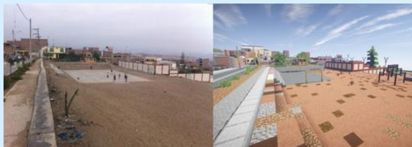
In some countries, citizens can participate in city planning using the tools in Minecraft.

The United Nations is working with kids to come up with new ways to make their towns and cities more sustainable. The program uses the popular video game Minecraft to crowdsource planning ideas. Kids from over 15 countries have participated so far.