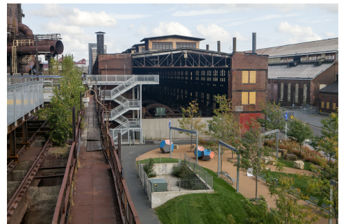
In Bethlehem, PA, a new arts and entertainment complex was built on former industrial sites.

When we think about how to build sustainably, we weigh many factors, including the impact on people, the planet, and the economy. Over time, our priorities change, and we can decide to use resources in new ways. If we work together, we can find innovative solutions to today's challenges and make tomorrow's world a better place!