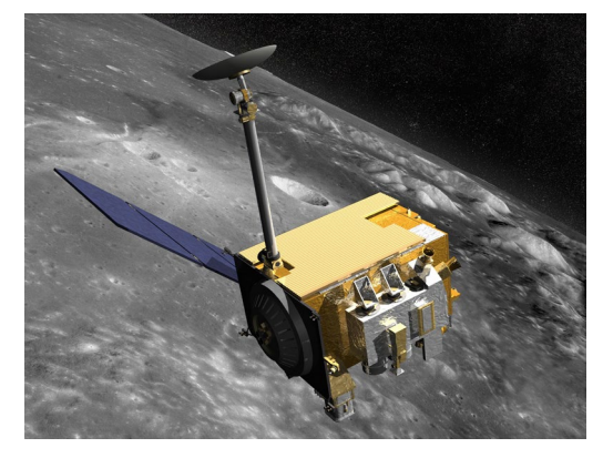
The Lunar Reconnaissance Orbiter is providing a close-up view of our nearest celestial neighbor.

NASA's Lunar Reconnaissance Orbiter has been orbiting the Moon since 2009. The spacecraft's on-board instruments, including a system of three cameras, capture high-resolution images of the Moon's surface from orbit. These observations have revealed new details about the Moon, including frost in some of its craters and mysterious patterns of light and dark material that have been dubbed "tattoos." Scientists believe that the Moon's magnetic field may be part of the cause for these light and dark patterns.