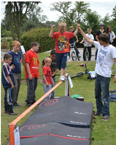
Being aware of their center of mass helps kids balance.

All mass exerts a gravitational force. Earth pulls on the Moon, and the Moon pulls on Earth. Gravity causes Earth and the Moon to orbit their shared center of mass. This point is inside Earth, but not exactly at Earth's center. For shorthand, we say that the Moon orbits Earth, but, more precisely, they both orbit a shared point—the barycenter!