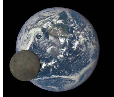
A NASA camera shows a rare view of Earth and the Moon from 1 million miles away.

Stars, planets, moons, and other objects in space orbit around each other because of gravity. In this activity, you created a spinning model of two objects orbiting. They are actually orbiting around a shared center of mass . A center of mass is the exact middle of all the material, or mass, of an object or collection of objects. This shared center of mass, where the rod balances on the sling in the model, is called the barycenter . If the two objects are about the same size, the barycenter lies roughly halfway between the two objects. If one object is smaller and the other object is bigger, then the barycenter is closer to—sometimes even within—the bigger object.