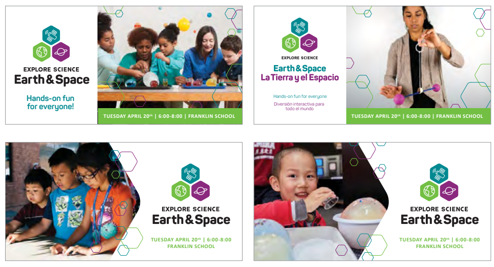
Each ad layout is provided in both English and bilingual format

To help you promote your event, PDF, JPEG, and Adobe Illustrator files are provided.