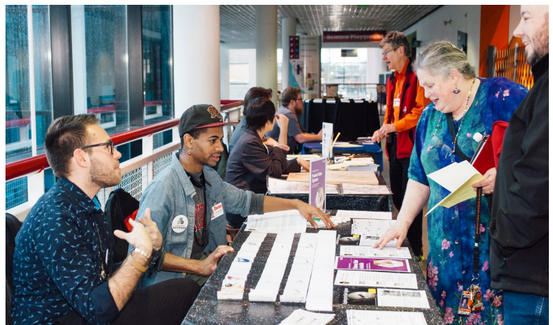
Educators, scientists, museum volunteers, and other professionals use NISE Net materials to engage diverse participants in learning about STEM.

“The NISE Network has been key to my career growth and success. The professional development and networking aspects of NISE Net have had a huge impact on the field.”