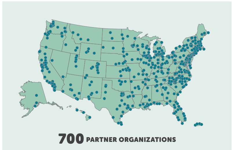
The NISE Network is active in all 50 states and several US territories.

Anyone that takes part in our activities and uses our free resources is part of the NISE Network! There are many pathways to participating in NISE Net. Receiving one of our hands-on activities toolkits, attending one of our online workshops, or downloading any of our free resources on nisenet.org are just a few ways to get involved in the Network. To get started, sign up for our newsletter and reach out to your regional hub leader: nisenet.org/contact .