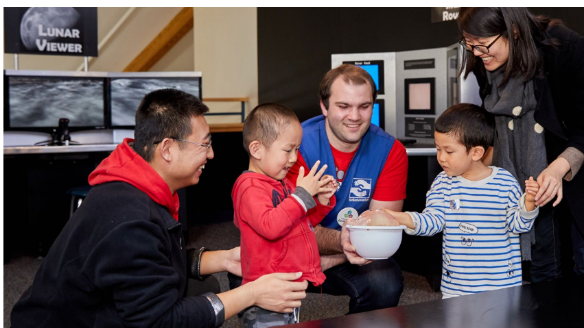
Informal STEM education is vital to creating a pathway from initial interest through the development of an identity as a science learner, and, in some cases, pursuit of a STEM career.

Informal STEM education is designed for everyone. The field is committed to promoting equitable opportunities for diverse learners. By gathering, studying, and sharing evidence about what works best, the field is continually improving in its efforts to involve all people in learning about and contributing to STEM.