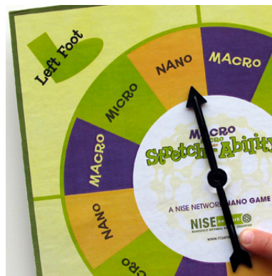
Left foot nano!