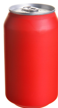
Nano-sized aluminum is explosive

For example, nano-sized particles of aluminum are explosive. Good thing regular-sized aluminum doesn't explode, or it would be dangerous to drink soda pop!