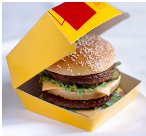
Nano-sized starch makes extra-sticky glue for packaging

For example, an extra-sticky glue can be made from tiny starch molecules that are only 100 nanometers in size. This eco-friendly adhesive is used to stick graphics onto cardboard packaging.