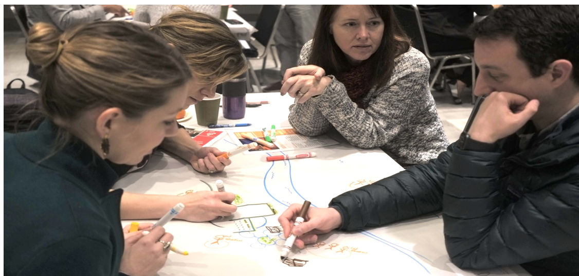
Small group work

Introduce the program and set the stage: Review the program goals and flow. Share the UN Sustainable Development Goals and introduce the idea that many communities are pursuing sustainability plans and initiatives. Next, present relevant current statistics for your community, such as: population, estimated population growth, demographics, average income, and any sustainability issues or community initiatives. Finally, if you have a guest speaker, introduce them.