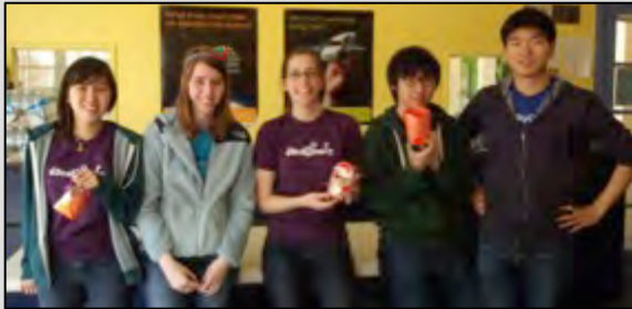
Olin College Engineering Discovery Team