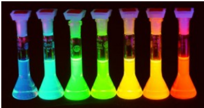
Differently-sized quantum dots glow with different colors when exposed to ultraviolet light.

Until recently, researchers often visualized these tiny biological players by “tagging” them with organic dye molecules. These dye molecules absorb light of only a very specific wavelength and then reemit it at a different, yet specific, wavelength. When attached to their subject of interest and illuminated at their absorbing wavelength, their characteristic glow can be viewed through a special filter. Unfortunately, these organic dye molecules break down rapidly, quickly losing their ability to glow. Meanwhile, they are also often quite toxic, and so are of limited use for the study of living systems.