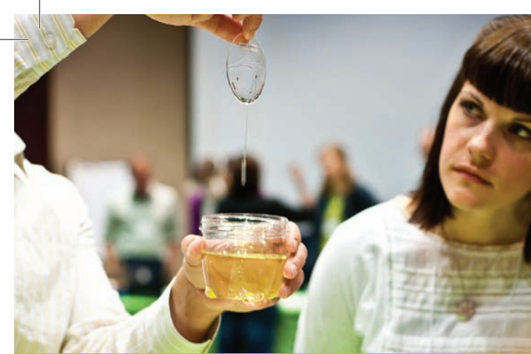
Making iridescent thin films