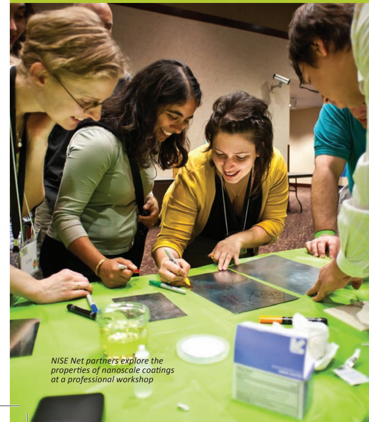
NISE Net partners explore the properties of nanoscale coatings at a professional workshop

The Nanoscale Informal Science Education Network™ (NISE Net) is a national community of researchers and informal science educators dedicated to fostering public awareness, engagement, and understanding of nanoscale science, engineering, and technology.