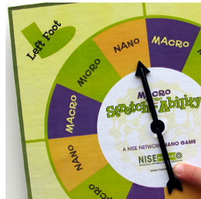
Left foot nano!