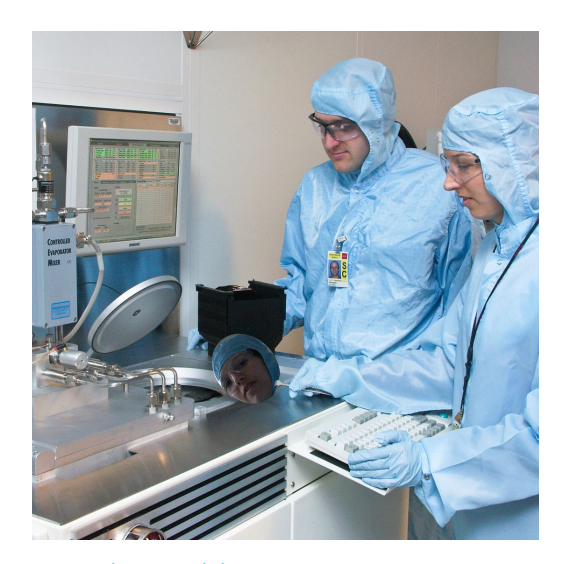
Researchers in a lab

Moving atoms around with regular tools is kind of like trying to build out of toy bricks with oven mitts on your hands! Like everyone else, scientists and engineers need the right size tools for the job.