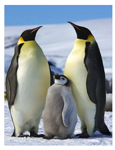
Penguins have adapted to live in extremely cold temperatures.

All living things on Earth reached their present form through evolution , the process by which organisms develop from earlier forms. Every once in a while, a random genetic variation makes an organism better adapted to its environment. Through natural selection , favorable variations are passed down to the next generations.