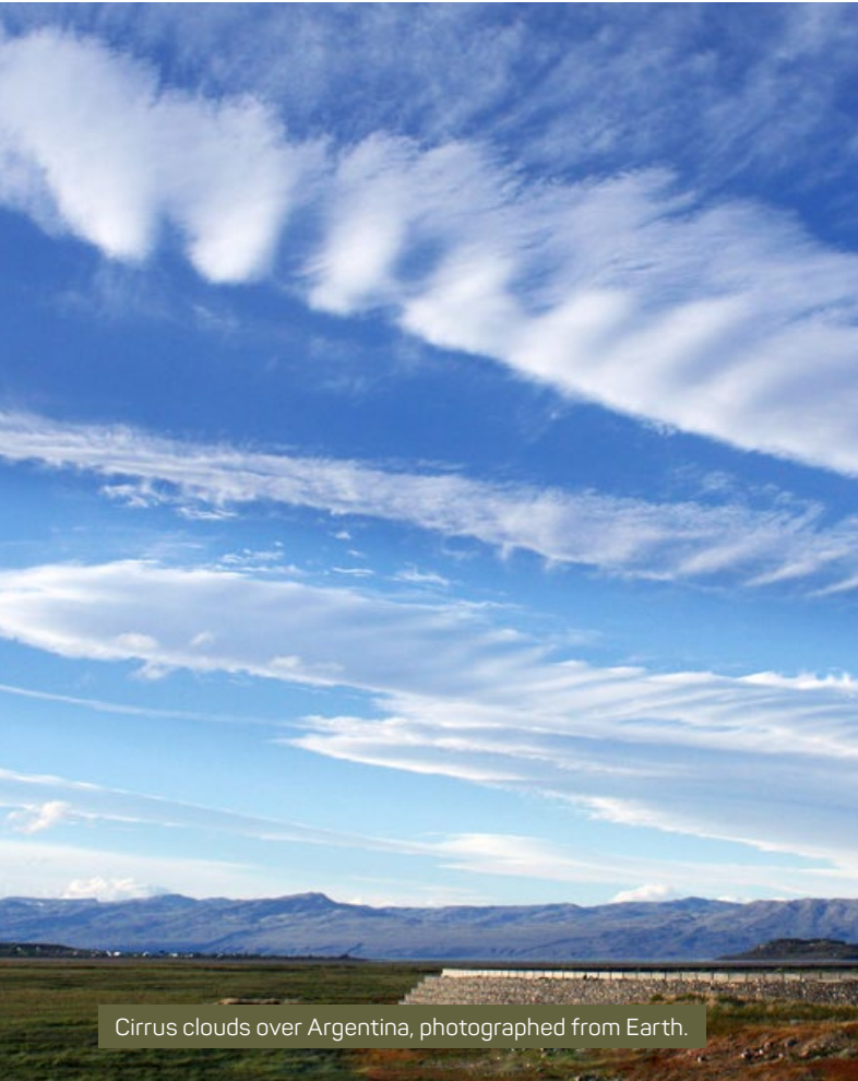
Cirrus clouds over Argentina, photographed from Earth.