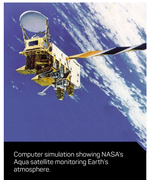
Computer simulation showing NASA's Aqua satellite monitoring Earth's atmosphere.

Citizen scientists across the US can participate in cloud research at home, at school, and in the community. Using the GLOBE Observer app, people can collect data about clouds and share it with scientists who work in collaboration with NASA. Together, citizens and scientists are doing important research that helps us predict daily weather and understand our planet's changing climate.