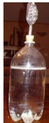
Microbial Lava Lamp