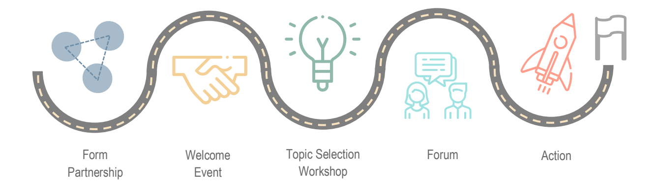
Figure 2. CC-PES Project Roadmap

The skills and expertise identified in the list above are not exhaustive, but instead summarize the key role of each partner and the rationale for their involvement in this project model. In addition to the project model shown in Figure 1, the teams involved in the CC-PES project have been provided with a roadmap toward their co-creation goals (Figure 2), with key events aligned to the model.