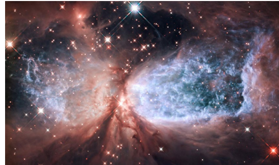
A newly formed star called S106 IR is shrouded in dust at the center of this image captured by the Hubble Space Telescope.

Stars are born when huge amounts of gas and dust clump together. Clouds of gas and dust—called nebulae —left over from past cosmic events like supernova explosions can be found throughout the universe. If the density of gas and dust clumping together becomes high enough, a star can form. The more gas and dust that clump together, the higher the new star’s mass! Most known stars range from less massive and cooler red dwarf stars to more massive and very hot blue stars .