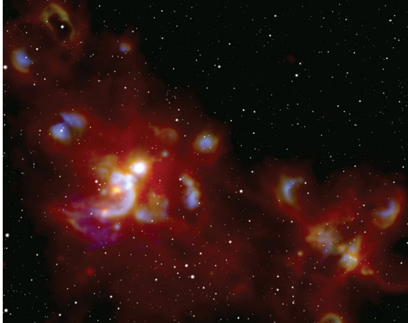
The youngest stars in this image of the stellar nursery WS1, taken by SOFIA, are in the bright ball near the center.

raises the temperature of its core. Eventually, this process releases enormous amounts of energy through nuclear fusion , and the new star begins to shine.