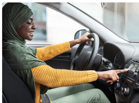
By tuning a car radio to a station that plays your favorite music you are selecting a radio wave frequency.

There are many uses of radio technologies in modern communications, from broadcasting a band’s latest song on a radio station to receiving important navigation signals from a satellite. To prevent a giant mix-up of radio waves and their functions, different devices use different radio frequencies . Low radio frequencies have longer radio wavelengths, while high radio frequencies have shorter radio wavelengths. These differences mean that some radio waves travel better through certain materials. That’s why we can receive cell phone calls inside a house but not inside an underwater tunnel, or why AM radio signals can get lost going under overpasses but FM radio keeps working. The choice of materials for your Faraday cage may allow you to examine some of the differences in radio waves used by various communication devices.