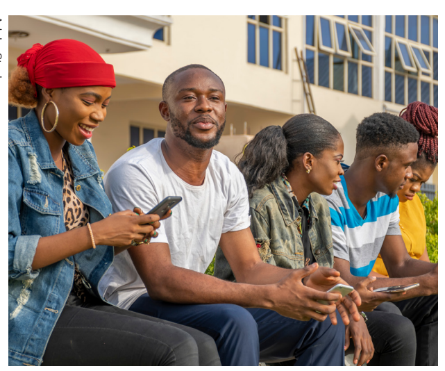
Not all family members or friends agree on the most important technologies. What could cause different opinions?

When sorting the Technology cards by importance, you might make different choices from someone else in your family, your neighborhood, or a different country. It can be hard to guess which technologies a different person might choose based on their lived experience, needs, or fears. People make decisions about which technologies are developed, adopted, and used individually and as a society. Our values shape how radio technologies are developed and used.