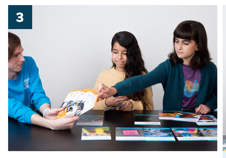
Place the radio technologies in order of importance. In your opinion, which ones are the most useful? Which are less useful? Do you have a favorite? Do any scare you?

Now choose one of the Radio Futures Cards featuring a person. Pretend you're the person on the card. Do you think they would decide that the same radio technologies are important? Would they change the order of the Technology cards? How do their personal experiences and values shape which technologies you think they'd choose?