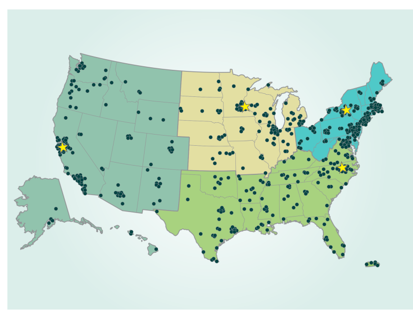
NISE Network partners engage public audiences in learning about current science, technology, math, and engineering in all 50 states and Puerto Rico.

The National Informal STEM Education Network (NISE Network) is a community of educators and scientists dedicated to supporting learning about science, technology, engineering, and math (STEM) across the United States. The Network creates resources and coordinates activities on a national and regional level, while Network partners coordinate and implement project activities locally. We achieve our reach and impact through the participation of over 600 partner organizations in Network activities, including museums, universities, and other organizations that provide informal learning opportunities for public audiences. Together, Network partners engage 11 million people each year in high-quality STEM learning.