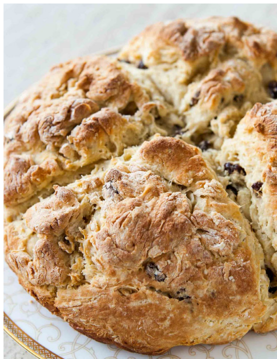
Baked goods like Irish soda bread often rely on the chemical reaction between baking soda and buttermilk (or another acid) to rise.

You may recognize our mini-rocket fuel materials as things that you use in your own homes. Baking soda is a common ingredient in many baked goods because of how it reacts to other ingredients. When it is combined with ingredients that are very acidic, such as buttermilk, a chemical reaction similar to what happens in our rockets creates carbon dioxide bubbles that help make baked goods light and fluffy. Think of your kitchen as a kind of laboratory. In our kitchens, we use many chemical reactions to change ingredients in different, and sometimes delicious, ways.