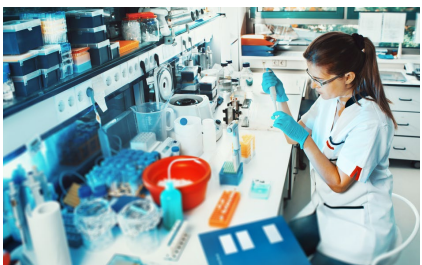
Chemists, like this undergraduate student, experiment by asking questions and testing predictions.

In this activity, you experimented with a chemical reaction. In the presence of water, citric acid and sodium bicarbonate (also called baking soda) react to form sodium citrate, water, and carbon dioxide gas. The carbon dioxide gas is what pops the top off the tube—launching your mini-rocket!