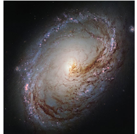
Galaxies, like M96, are moving away from each other.

Most of the galaxies we can observe are moving away from each other as the universe expands. Like the stretchy elastic bands in this activity, space is expanding and stretching. But not everything expands. Some objects are held tightly together by gravity, such as our bodies, the Earth, our solar system, and even galaxies like the Milky Way. Like the buttons in our model, these remain about the same size, even as the distances between them increase. As the elastic in our model stretches, the outer buttons move away from the center faster than the inner buttons do. Astronomers have observed and calculated that distant galaxies appear to be moving away from our perspective faster as well. This is because the rate at which a galaxy moves away from us is directly proportional to its distance from us, a relationship that we now know as Hubble's Law .