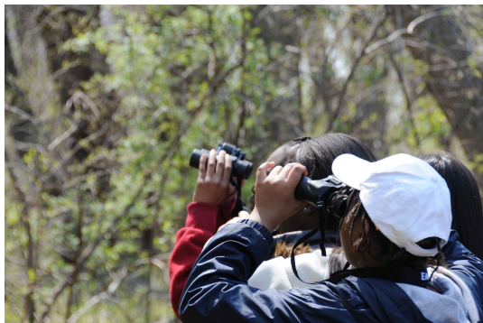
Sometimes people use binoculars to bird-watch.

People use binoculars to watch birds in trees, see rocks on faraway mountaintops, find features on the Moon, or search for planets in the night sky. The binoculars allow us to see more detail in these distant objects so we can learn more about them.