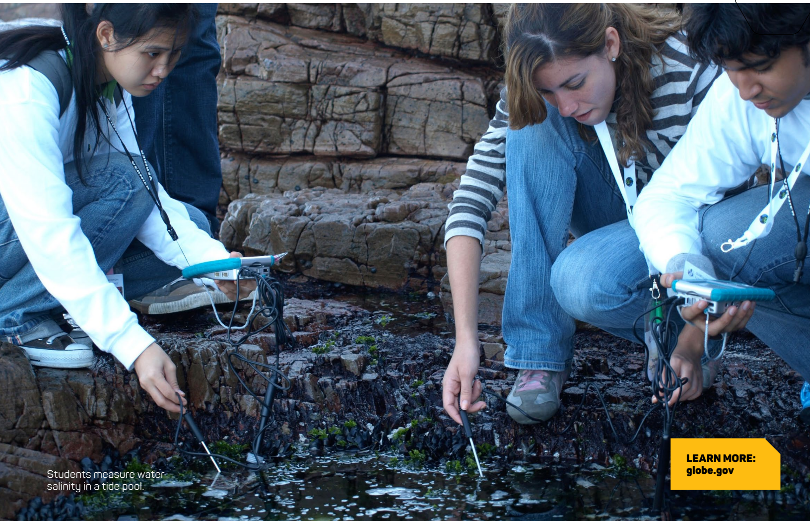
Students measure water salinity in a tide pool.

A NASA-sponsored program encourages all of us to be scientists.