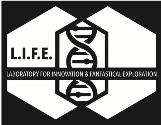
Alternative single color options