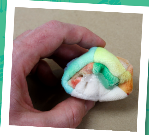
Take a limb, head or torso and hot glue the opening(s).