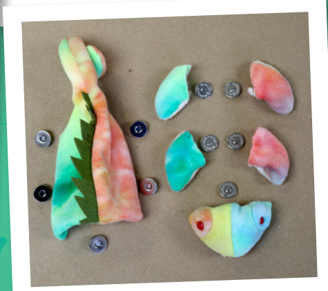
The limbs and head of the toy will each require a pin side snap. The torso of the toy will require 5 (or more!) magnet side snaps.