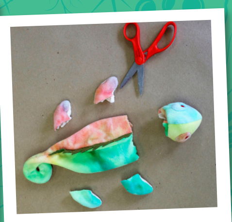
Dissect the toy by removing the limbs and head from the body. Remove some of the filler but keep enough to give the body form.