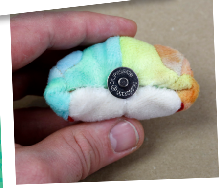
Apply a small bead of hot glue to each toy part and then gently press the appropriate snap side onto the glue.