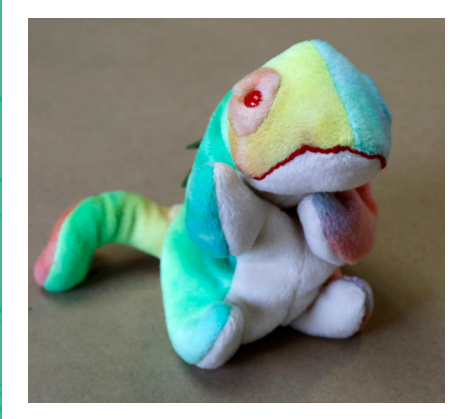
Start with an abandoned, unused, or otherwise discarded stuffed animal or toy.