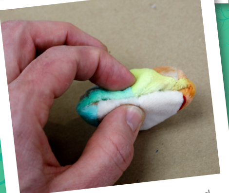
Very carefully press fabric around the hot glue sealing the opening shut. Check your work to make sure that the body isn't leaking filling.