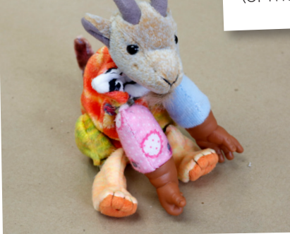
Allow ample time for the glue to cool and your Frankentoy parts are ready!