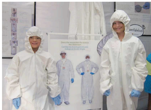
UMD MRSEC campers explore the Cleanroom.

exhibit installation. Major funding for NanoFabulous was provided by the National Science Foundation, with additional funding from University of Maryland, College Park Departments of Physics and Chemistry & Biochemistry, and contributions from National Institute of Standards and Technology (NIST).