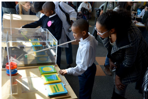
A MRSEC graduate student works with a 3 rd grader at the Probes Table.

NanoFabulous Developed by the University of Maryland, College Park Materials Research Science & Engineering Center