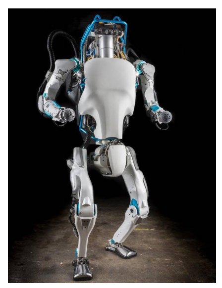
Robots are becoming more like humans. Some experts think that they could become a new species, Robo sapiens .

Do you think humanoid robots are friendly or creepy? Does it make a difference what they look like?