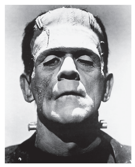
Actor Boris Karloff tried to show the humanity of Frankenstein's monster. Karloff played the creature in many Hollywood movies.

What do you think Victor should have done when he realized the creature committed a crime?