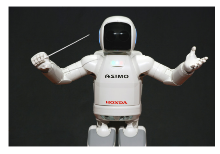
Robots can appear almost human in their ability to sense, plan, and act. This robot can conduct an orchestra!

Researchers who study artificial intelligence make machines that can reason and learn over time. Like your scribble bot, some of these machines can make art. Robots that can make art blur the lines between people and machines.