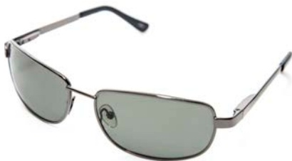
Some eyeglass lenses darken in sunlight

The UV beads in this activity change color as a result of nanoscale shifts in the shape of the dye molecules. The molecules are too small to see, but we can see the resulting change in color.