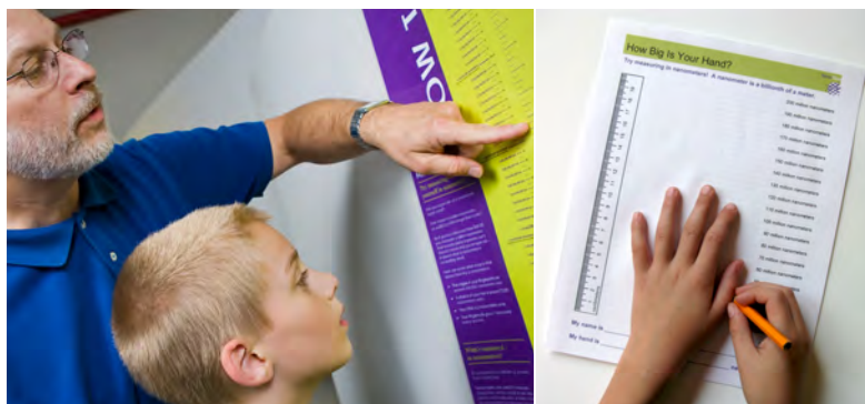
Measure yourself in nanometers!